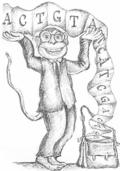
Fig. 4 Kofeau with string of letters.

Without turning to Kofeau, the professor went on: “The ‘book of life’ is very different from the book your little classmate is showing you. The ‘book of life’ is like a long — very long in fact — sequence of letters that we cannot read. It does not tell the story of any specific person’s life.” Setting the autobiography aside, Kofeau’s scrawny fingers plunged into the bag yet again, fishing out an immensely long ribbon. It was so long that it seemed as if would take him forever to find the other end. The class applauded thunderously, and the little monkey seemed pleased with his audience’s reaction. Kofeau’s ribbon revealed a sequence of letters; Alice wondered what they stood for.