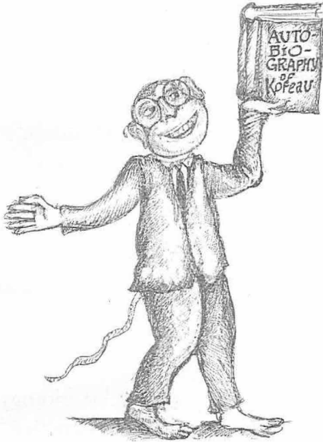
Fig. 3 Kofeau with biography.