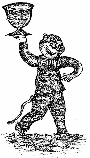
Fig. 2 Kofeau water content.

instructions from the professor, but when nothing came, he sank back into his chair, and nonchalantly continued his earlier pre-occupation — rolling his eyes and searching every nook and cranny of the room.